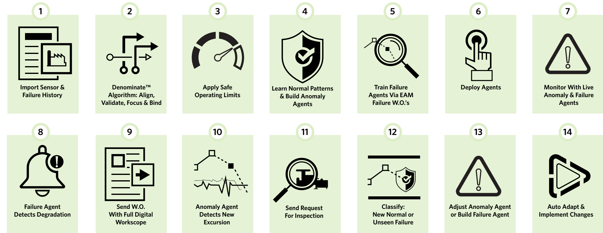
Figure 1: Prescriptive Analytic Methodology

The latest APM innovation combines real machine learning and physics-based models to deliver meaningful prescriptive analytics that give a detailed report and recommended action well before a looming event occurs.