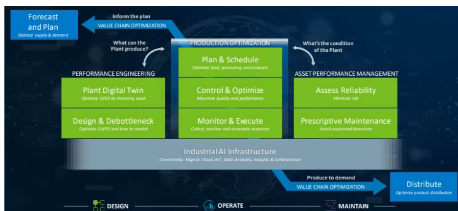
Asset Optimization: Extending the Lifecycle

Collectively, these uncover insights into the condition of plant assets and processes across the enterprise, help improve asset availability and uptime, and optimize production processes and asset effectiveness in such important areas as planning and scheduling, control and optimization, and monitoring and execution.