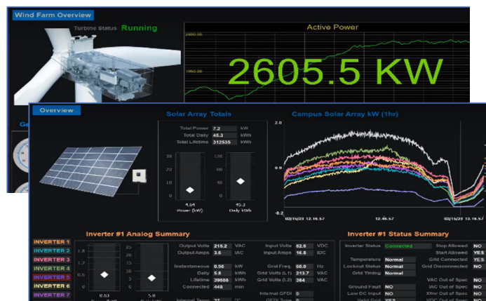
Figure 2. Detailed displays of renewable generation assets, including real-time values, trends integrated with historical data and alarm conditions..