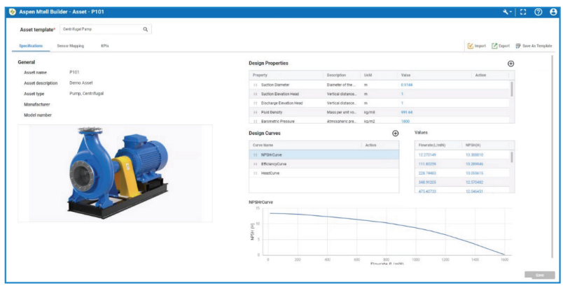
Figure 2. Example of Aspen Mtell asset template (centrifugal pump).