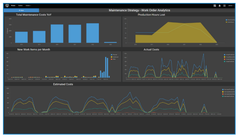
Figure 4. KPIs and Dashboards for Aspen Mtell.

Aspen Maestro. Aspen Mtell's breakthrough technology aids users in building agents. It effectively addresses the three major challenges in successful agent building: data selection, data cleaning, and the integration of domain expertise. Aspen Maestro's Al-driven capabilities simplify data preparation by automatically identifying critical sensors, the optimal input parameters for creating effective agents, delineating data regions for testing and training, fine-tuning hyperparameters, and determining the required sampling frequency for analysis. Aspen Maestro automates the feature selection process, aiding in the identification of significant features within the data. It recognizes the importance of utilizing data to reinforce engineering principles and